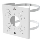
SN-CBK627D Pole Mount